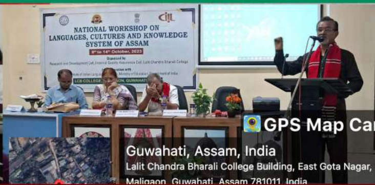
Guwahati, Assam, India Lalit Chandra Bharali College Building, East Gota Nagar, Maligaon, Guwahati, Assam 781011, India