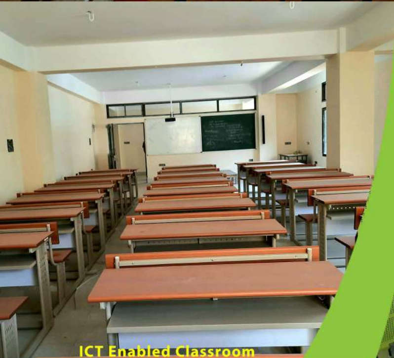
ICT Enabled Classroom