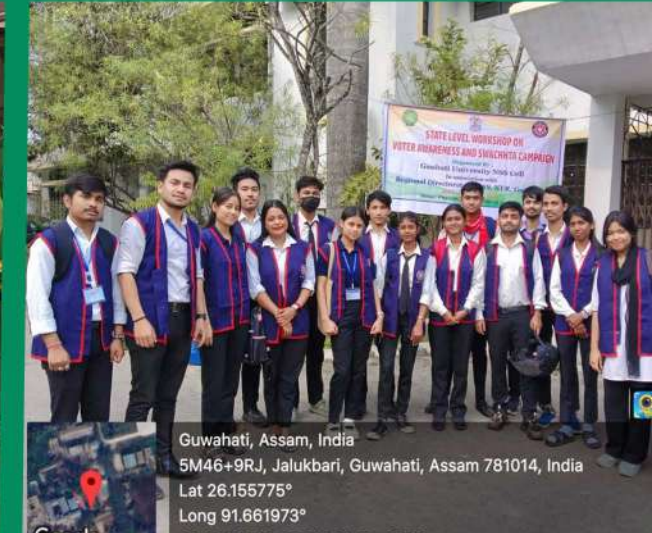
Guwahati, Assam, India 5M46+9RJ, Jalukbari, Guwahati, Assam 781014, India Lat 26.155775° Long 91.661973°