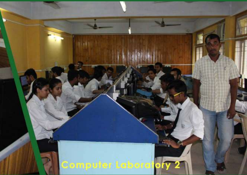
Computer Laboratory 2