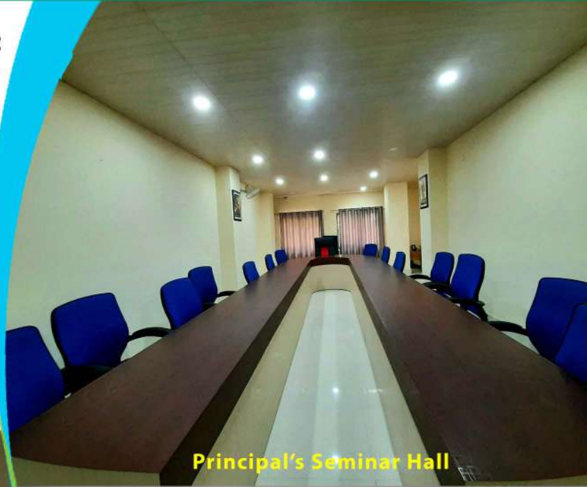
Principal's Seminar Hall