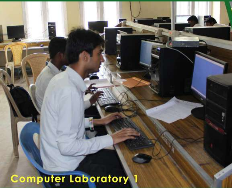
Computer Laboratory 1