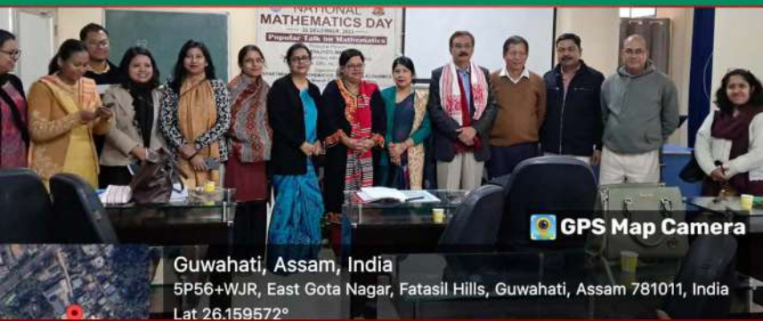
Guwahati, Assam, India 5P56+WJR, East Gota Nagar, Fatasil Hills, Guwahati, Assam 781011, India Lat 26.159572°