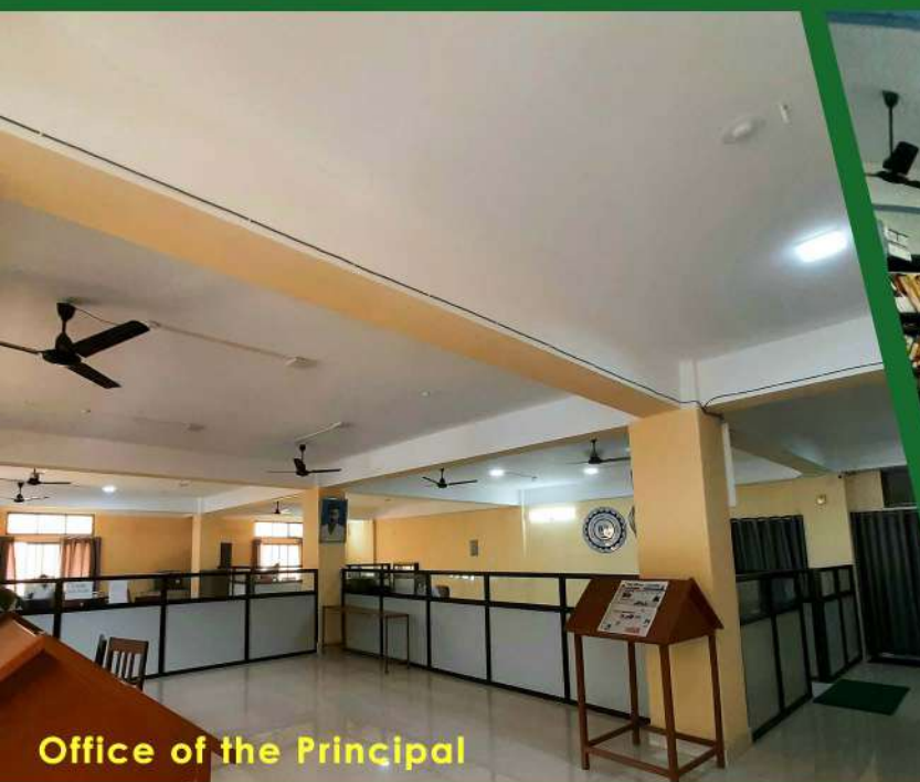
Office of the Principal